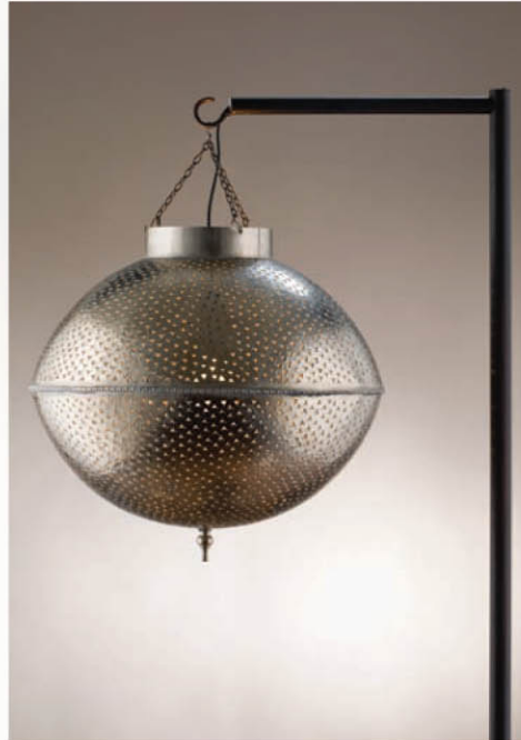
sphere floor lamp