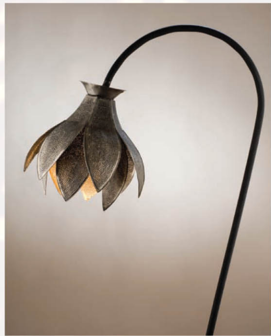
lotus floor lamp

Brass shades provide the option for use in external settings.