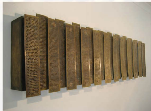
fence wall light