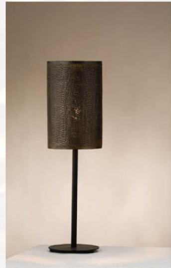
drum table lamp