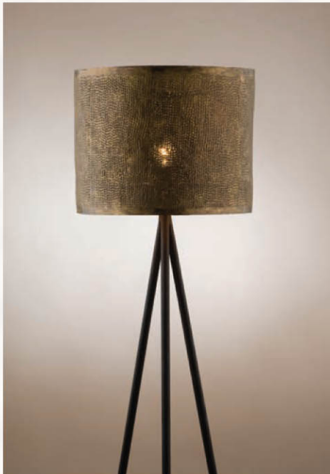
drum tripod floor lamp