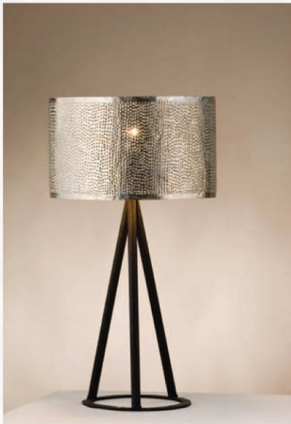
drum tripod table lamp

Dido shades have been designed to function as pendants, table or floor lamps.