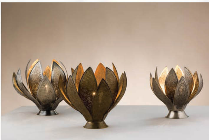
lotus table or floor lamps